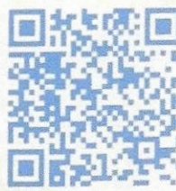
Passive Leg Raise