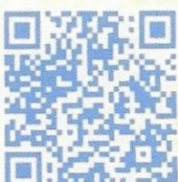
Vascular Foot Position